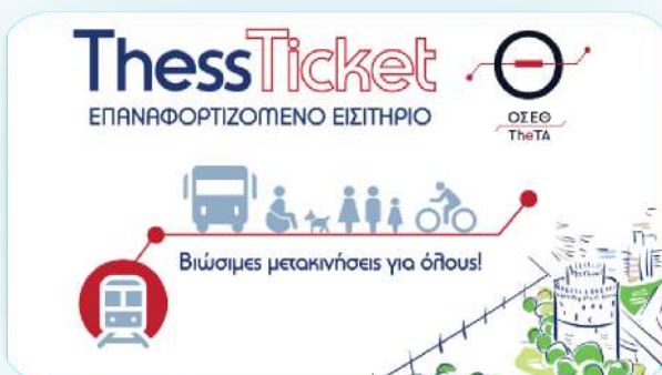
BUS/METRO RECHARGABLE TICKET

Overall, the best way to get around Thessaloniki is the metro because of speed and comfort, but buses are a good alternative choice for reaching further the city center.