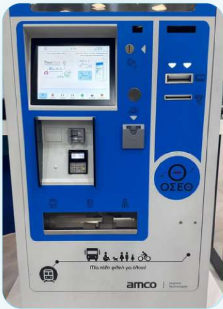
BUS TICKET MACHINE

The public transport system in Thessaloniki includes buses and the new metro. Buses are the main form of transport and cover almost all areas of the city, including the suburbs, but they are often late because of traffic.